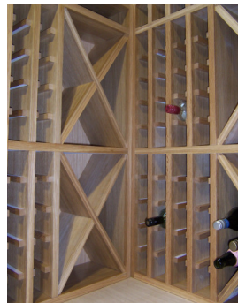
White OAK wine rack